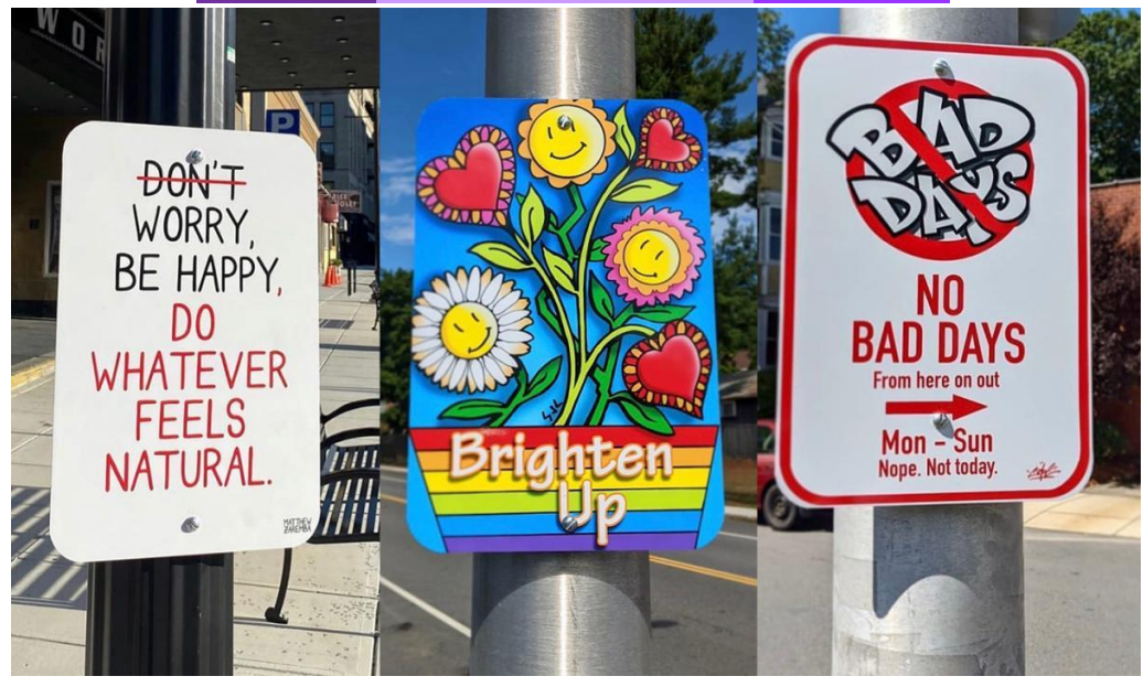
Explore the Public Art of Worcester, Massachusetts

If you're looking for a unique, family-friendly and photo-worthy outdoor activity in Worcester, we have the perfect itinerary to keep you occupied for an entire afternoon. Give Me A Sign" features inspirational signs installed throughout Worcester.