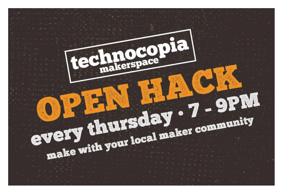
44 Portland St., Fl 6, Worcester, MA 01608 Free

7:00 PM to 9:00 PM, Recurring weekly on Thursday